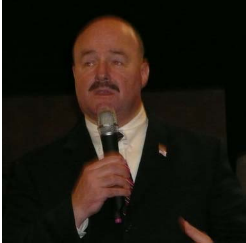
Senator Fred Madden (NJ District 4)